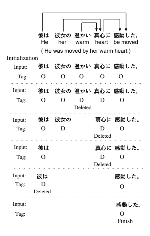
Figure 1: Example of the parsing process with cascaded chunking model

We think this proposed cascaded chunking model has the following advantages compared with the traditional probabilistic models.